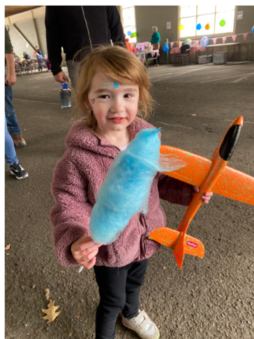
It's a ringer!