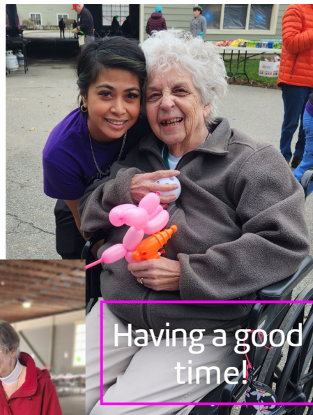
Having a good time!