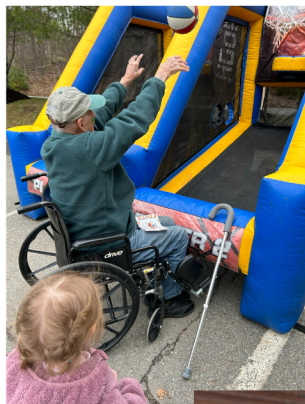
G O B I L L