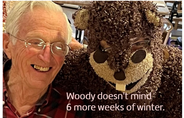
Woody doesn't mind 6 more weeks of winter.