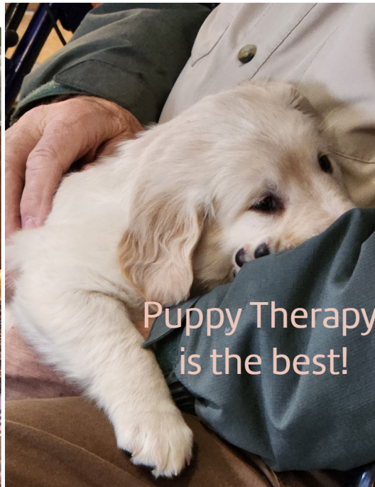
Puppy Therapy is the best!