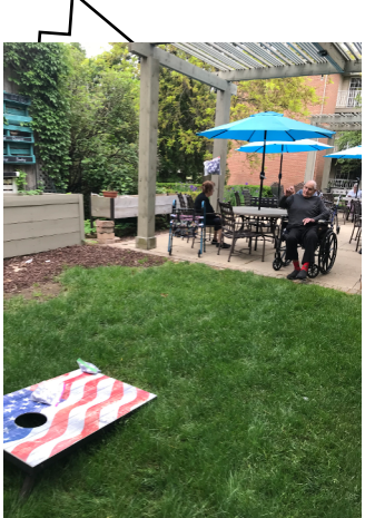
Staying Active Cornhole Chair Volleyball